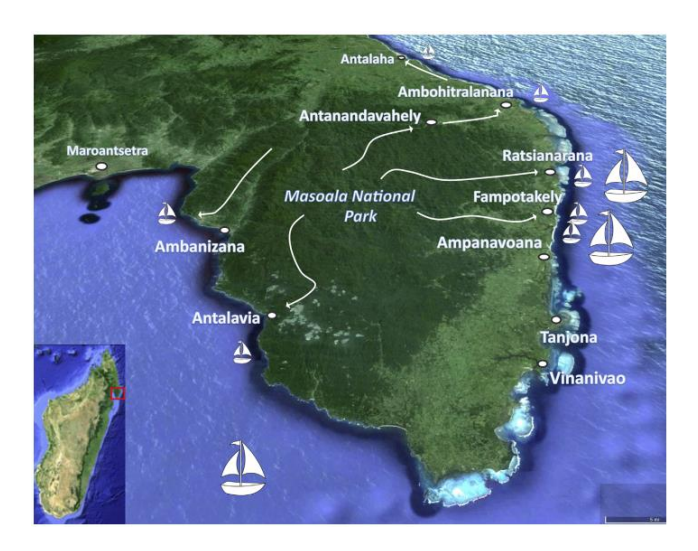
Figure 2: Map of the flow of logs from Masoala National Park. Rosewood logs travel from the park's interior to the villages and coastal boats for overseas shipment (Anonymous 2017).

(Ong and Carver 2019). Later in 2017, CITES listed all the world's Dalbergia<sup>4</sup> species, as well as other rosewoods, under Appendix II, banning their trade (Ong and Carver 2019).