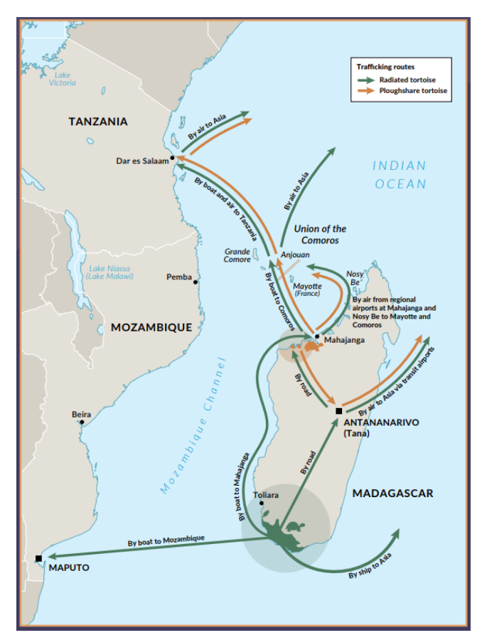
Figure 3: Major trafficking routes of ploughshare and radiated tortoises, within Madagascar and across the region (Nelson and Cochrane 2020).

to Antananarivo; tortoises and heroin are both trafficked through airports; and tortoises, cannabis and illegal migrants are smuggled by boat to Comoros (Nelson and Cochrane 2020). While these products all use the same routes — and likely the same facilitators who arrange transport and pay bribes to corrupt officials — there is no evidence that the same criminal networks are involved in moving both tortoises and other illicit products (Nelson and Cochrane 2020).